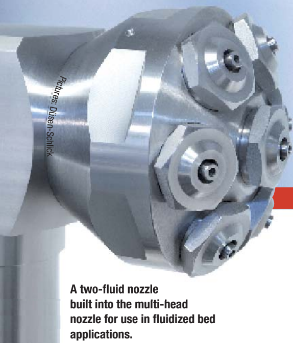
A two-fluid nozzle built into the multi-head nozzle for use in fluidized bed applications.