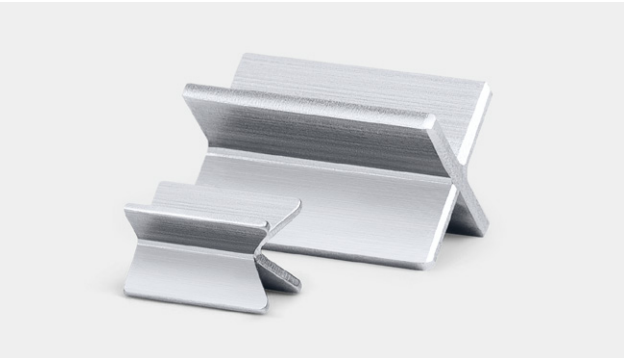
High-performance nozzle exit unit and stabiliser design

Rotating nozzles of size Ø 10 mm are only manufactured with a bore. At sizes of Ø 18 mm. the nozzle can also be fitted with a nozzle exit insert of hardened stainless steel. From Ø 22 mm. nozzle exit inserts are always fitted.