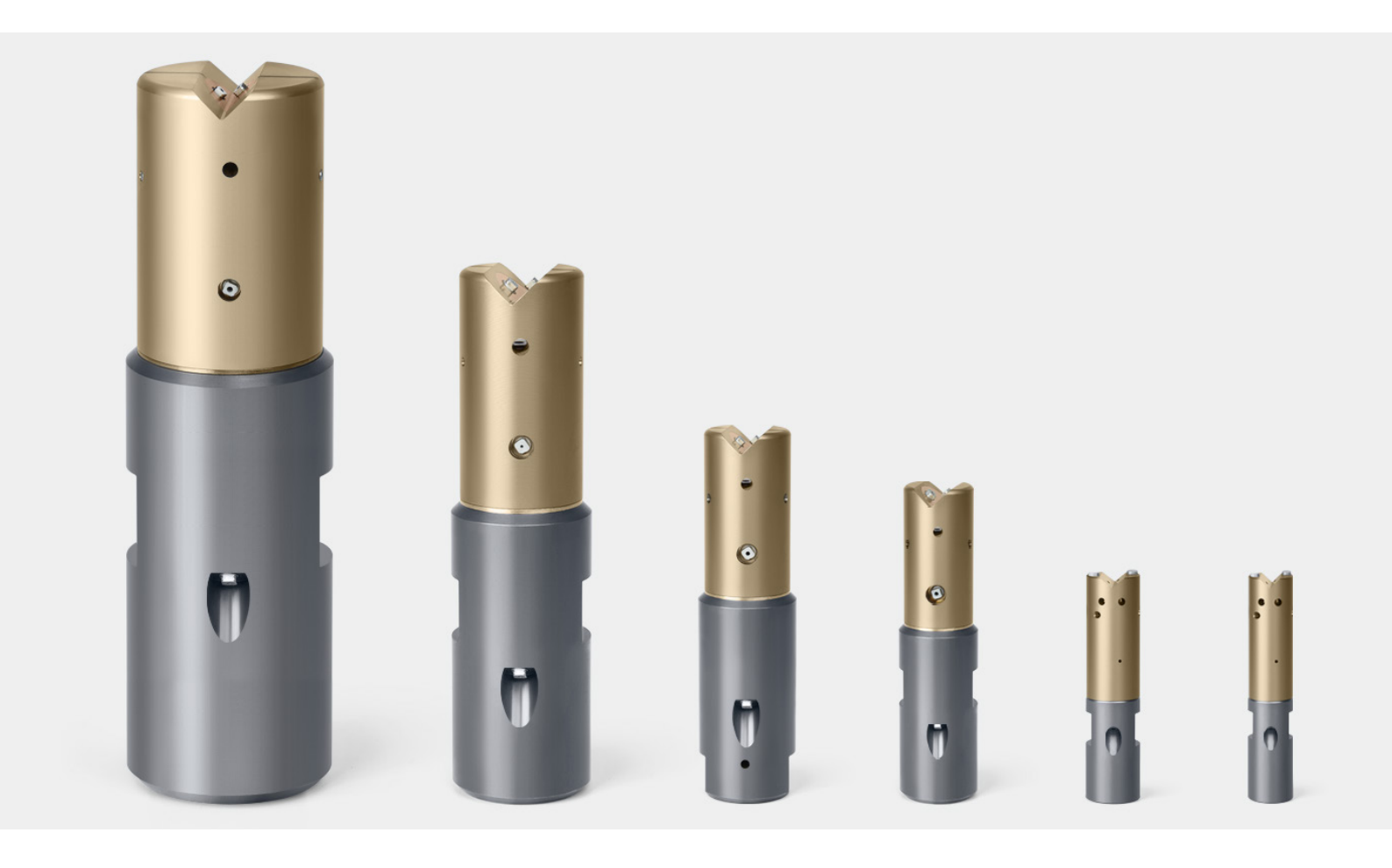
EHS high-performance rotating nozzles Data sheet