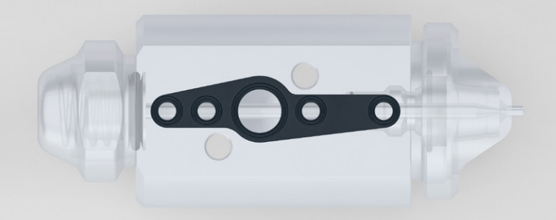
PCA nozzles with new flat gasket