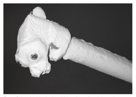
One of the old, blocked multi-head nozzles. It is no longer possible for fine droplets to pass through the heavily coated orifice areas; the thick film can also break off.